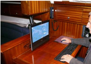
On a boat e.g. for navigation and entertainment