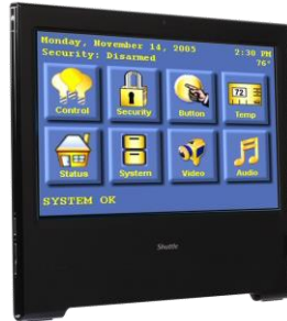
Smart Home Control Surveillance, Home Automation