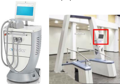
Device Control e.g. for health services or fitness equipment