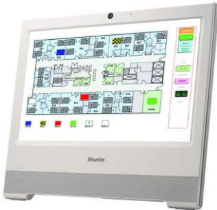
Call System e.g. for nurses (hospital) or security personnel