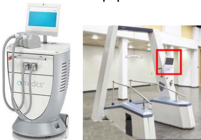
Device Control e.g. for health services or fitness equipment