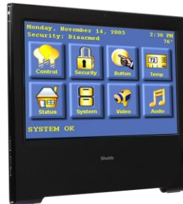
Smart Home Control Surveillance, Home Automation