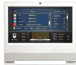
POS Radio Playing advertising and music