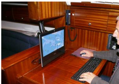
On a boat e.g. for navigation and entertainment