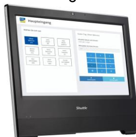
Data Collector e.g. Recording of working hours