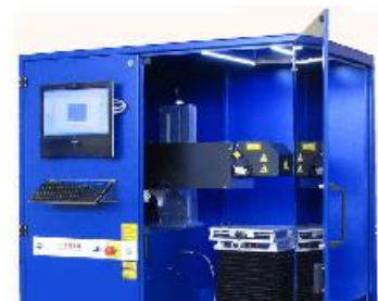
Visualisation e.g. for industrial production machines