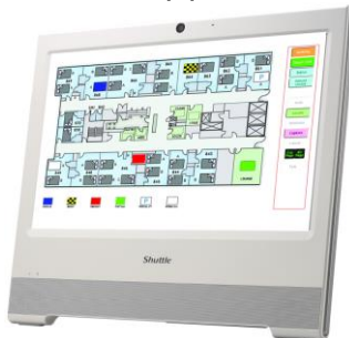
Call System e.g. for nurses (hospital) or security personnel