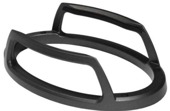
Vertical Stand PS01