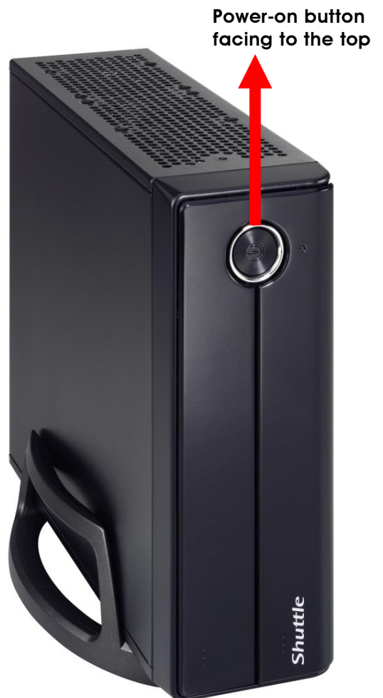
Shuttle 3L Slim-PC with PS01