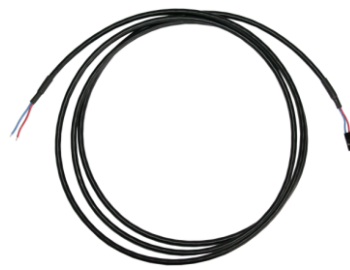
Adapter cable for external power button (CXP01)