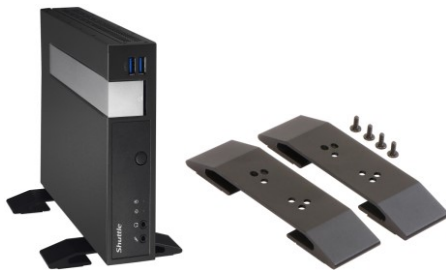
Stand for vertical operation (PS02)