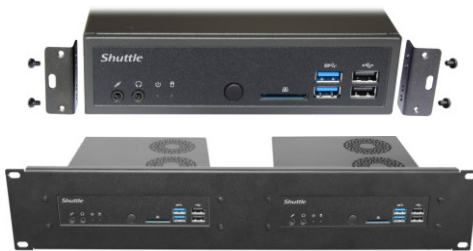
2U rack mount front plate for two Shuttle XPC slim (PRM01)